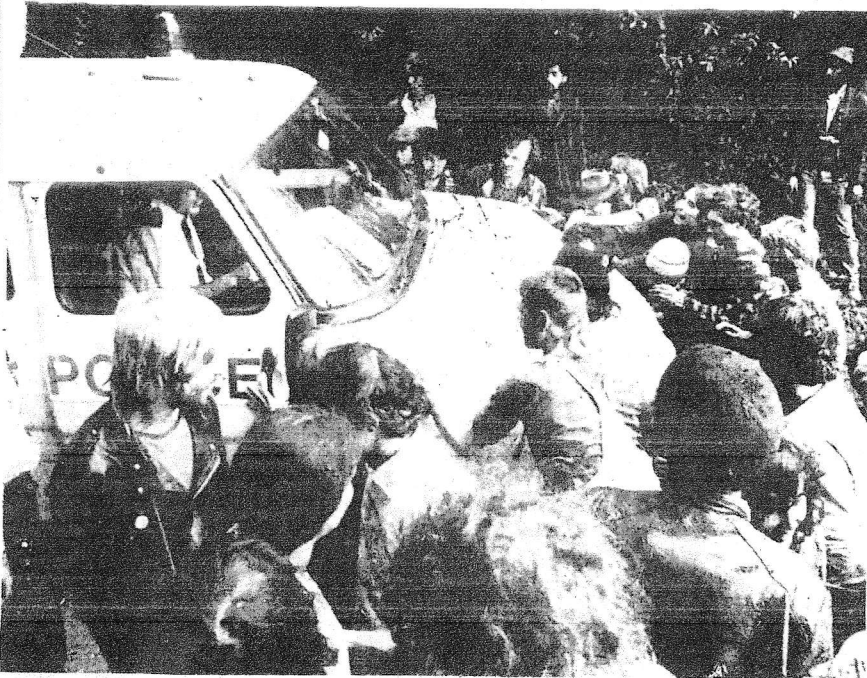
A solitary police van is removed to make way for the convoy outside the works entrance. The main body of police had gone to the front gate of the missile base.